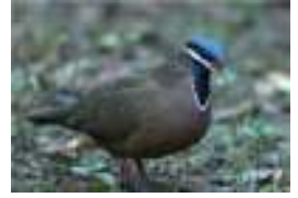
Blue-headed Quail Dove

The Guanahacabibes Peninsula , located at the far western tip of the island, is one of the last remaining wild places in the Caribbean. A major migratory corridor, this peninsula lies parallel to the Yucatan Peninsula in eastern Mexico, and adjacent to the Palancar Reef, the largest contiguous coral reef in the northern hemisphere, second in size only to the Great Barrier Reef. The peninsula is also home to a number of important aboriginal archaeological sites. The peninsula was Cuba's first significant protected area following the triumph of the revolution in 1959, and in 1987 declared a Biosphere Reserve by UNESCO. The Bee Hummingbird , Cuban Crow , Cuban Parrot , as well as numerous other birds are quite likely here (2 nights).