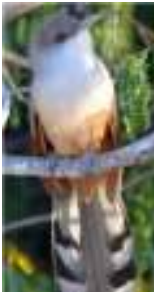
Great Lizard Cuckoo

CCT Cuba Bird Survey Programs include the following: all accommodations, all meals in Cuba beginning with dinner on day 1, ending with breakfast on the last day of the program, guide services, most tips (guides, drivers, naturalists and restaurant and bell staff), airport/hotel transfers, ground transportation, bottled water, some drinks, admission fees (itinerary only), U.S. Department of Treasury authorization documents, and program management services which include the provision of all pre- and post-program materials, a full-time Cuban bilingual guide, bilingual Cuban naturalists, and a fulltime driver. Program fees help support Caribbean Conservation Trust's bird conservation efforts in Cuba.